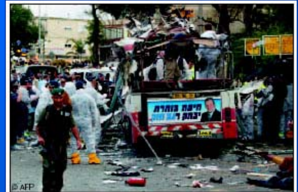
An Israeli soldier walks behind the debris of a passenger bus after a Palestinian suicide bomber attacked it in the northern Israeli town of Haifa, 5 March 2003.