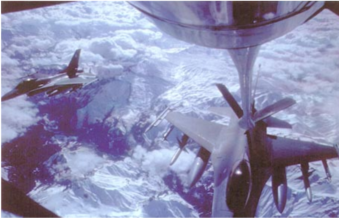
F-16 refueling during Provide Comfort.