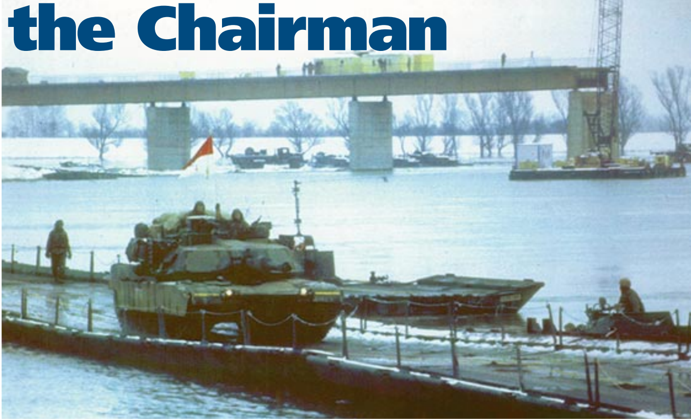
Crossing the Sava, December 31, 1995.