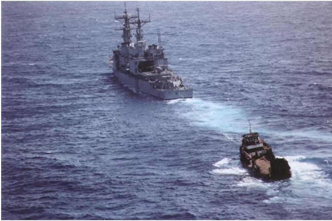
USS Kauffman with Haitian ship in tow.